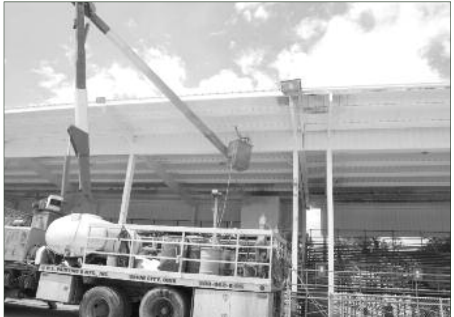
A painter from R.L. Painting and Manufacturing of Union City, Ohio, gives a fresh coat to the grandstand at the Jay County Fairgrounds.